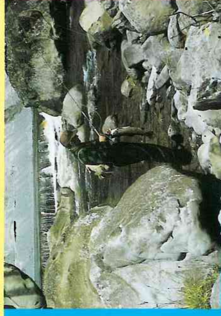
Large, bouldery pools provide ideal trout habitat in many stretches of the Ruakituri River

The middle stretches of the Ruakituri River are narrow and characterised by frequent, steep bush clad bluffs. Water flows as a series of pool, run, and riffle combinations, providing varied environmental conditions for fish. High numbers of trout in the middle section of the river are testimony to high quality habitat.