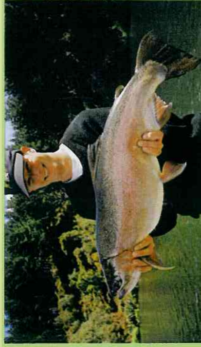
"Lake Aniwhenua is a great place for family fishing"

Between lakes Matahina and Aniwhenua the Te Teko/Murupara Road provides access to three main sites (sites 4-6). Spin fishing in the Rangitaiki has produced some exceptional results, as has flyfishing the Waihua and Mangamako.